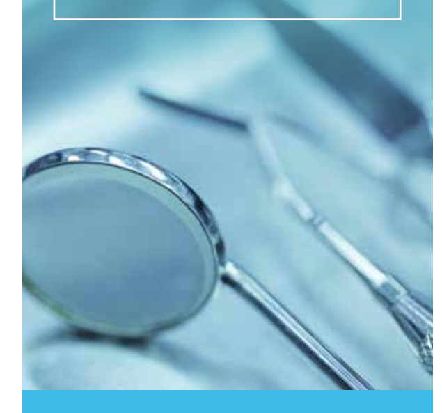
Benco Dental, the nation's largest independent dental distributor, has its corporate headquarters and main distribution center in a 272,800 square foot Mericle building in NEPA.

a dedicated and highly productive workforce,